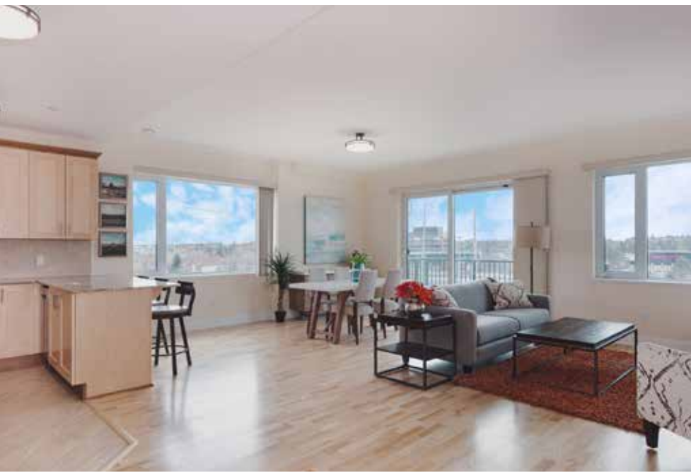
Spacious living areas, award-winning craftsmanship and luxurious amenities are hallmarks of Lépine's luxury apartments.