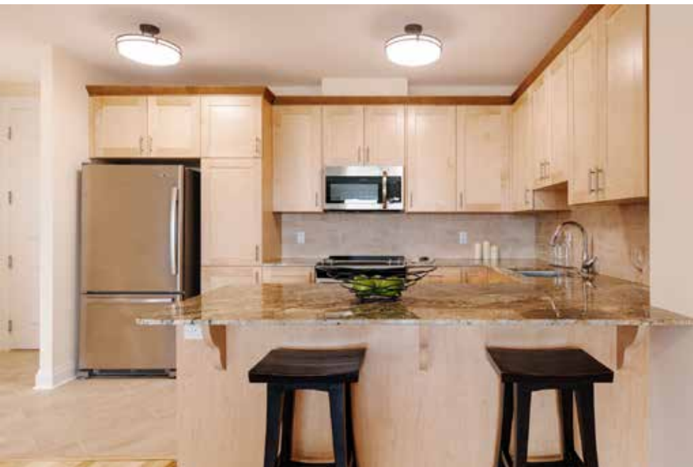
Each stylish Lépine apartment is self-contained and includes its own fresh-air intake so there is no air transfer from one unit to another.