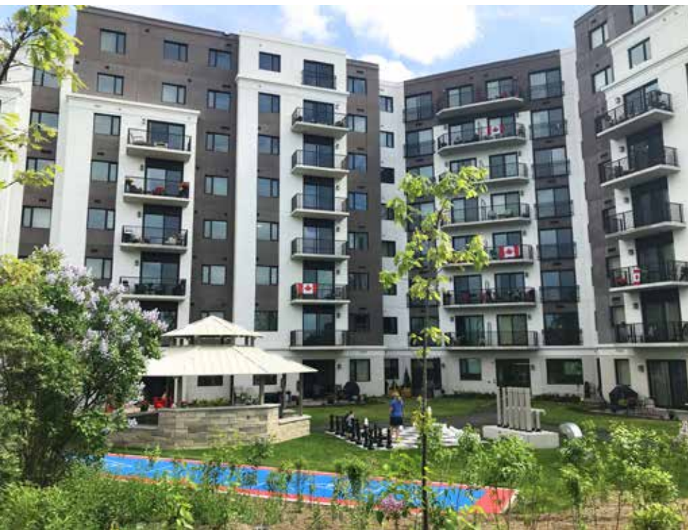
Every Lépine Apartment building includes an outdoor retreat where residents can go for a stroll, read, ponder, meet or just pause to smell the flowers.