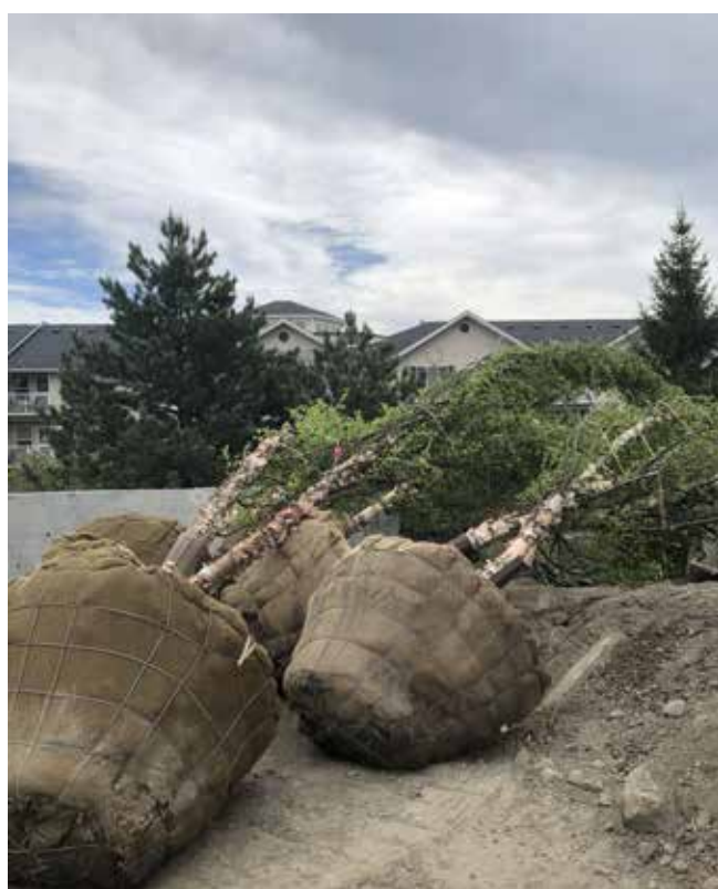
Lépine plants mature trees so the impact on the property is immediate and dramatic.

The concept has multiple advantages, not the least of which is the fact that it frees up aboveground space for recreational and other uses,